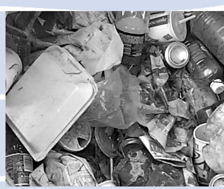
Street trash collected in a Salt Lake storm drain can make its way to Salt Lake and eventually to the ocean.

and homeowner groups to promote environmental awareness and the need to keep pollutants out of the streets and storm drains.