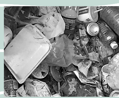
Street trash collected in a Salt Lake storm drain can make its way to Salt Lake and eventually to the ocean.

and homeowner groups to promote environmental awareness and the need to keep pollutants out of the streets and storm drains.